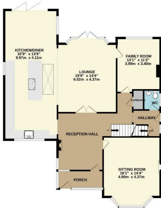
GROUND FLOOR 1460 sq.ft. (136.2 sq.m.) approx.