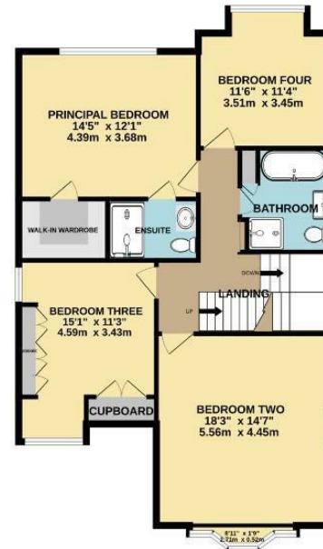
1ST FLOOR 979 sq.ft. (90.4 sq.m.) approx.